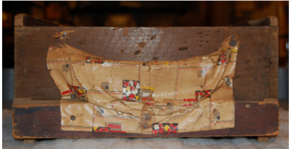
Canvas pocket found on the rear of one of the washstand's drawers.

If furniture style is not readily evident, another way to date furniture is by looking at the patina (surface aging and wear). The patina on the bureau washstand is not