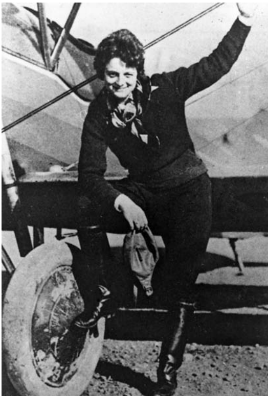
Bentonville's own pioneer aviator, Louise McPhetridge Thaden, circa 1927.