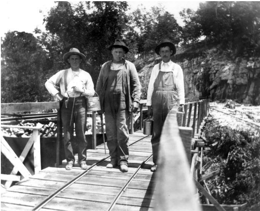
Workers stand on a tramway near the top of a lime kiln (back left) in Johnson, 1900s-1910s.