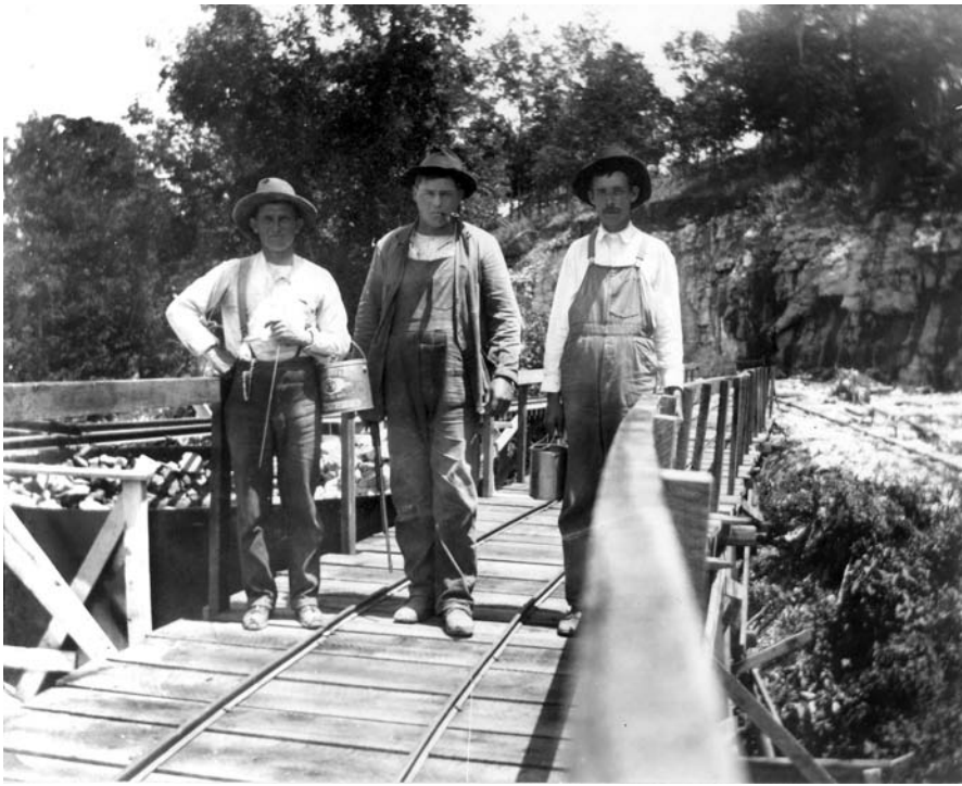
Workers stand on a tramway near the top of a lime kiln (back left) in Johnson, 1900s-1910s.