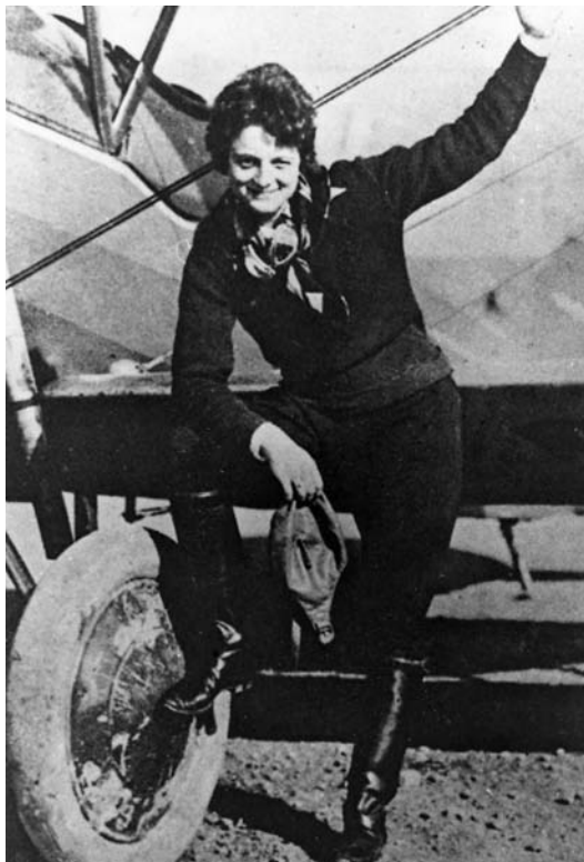
Bentonville's own pioneer aviator, Louise McPhetridge Thaden, circa 1927.